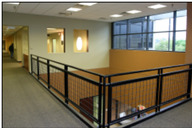
A view of the lobby area from the second floor.