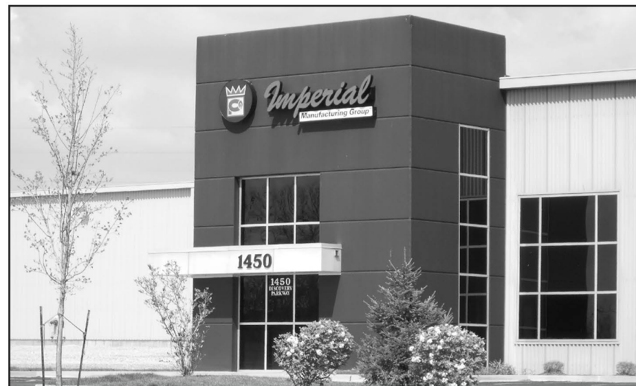
Imperial Manufacturing is an Alton Center Business Park tenant. Imperial employs 135 full-time workers at the mixed-use park.

Clark Properties closed on the purchase of the site in Fall 2000 and began the process to house office, warehouse and industrial tenants. Alton Center Business Park began leasing space to its first major tenant, American Water Works Service Co., in Spring 2001. The development captured SWIDA's Outstanding Development of the Year Award in 2000 and the environmental industry's prestigious